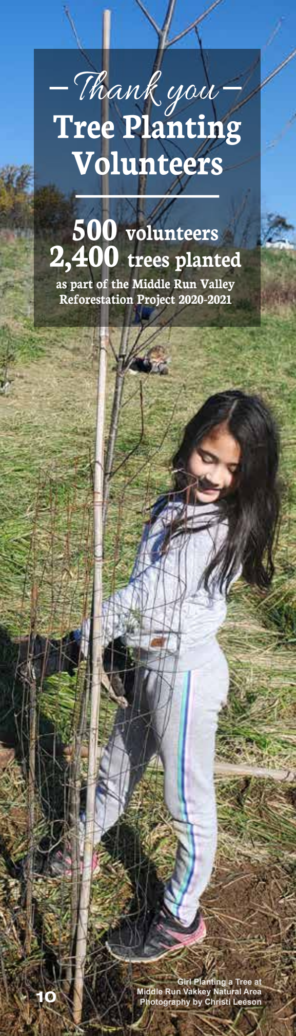
Girl Planting a Tree at Middle Run Valley Natural Area

500 volunteers 2,400 trees planted as part of the Middle Run Valley Reforestation Project 2020-2021