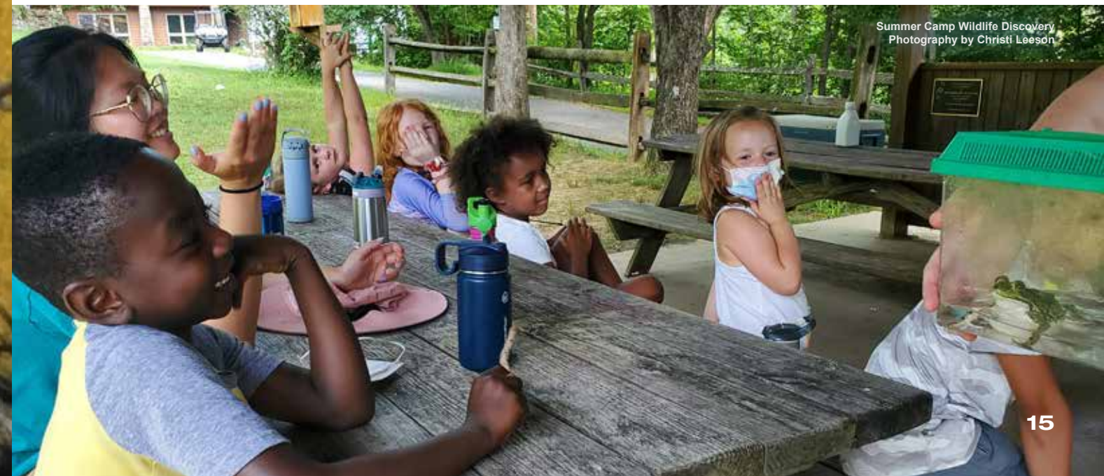
Summer Camp Wildlife Discovery